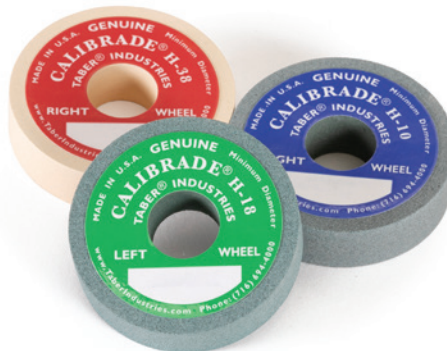
CALIBRADE® ABRADING WHEELS