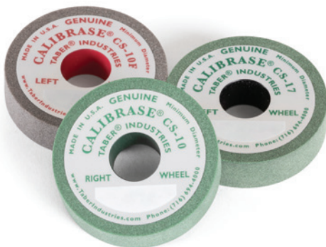
CALIBRASE® ABRADING WHEELS